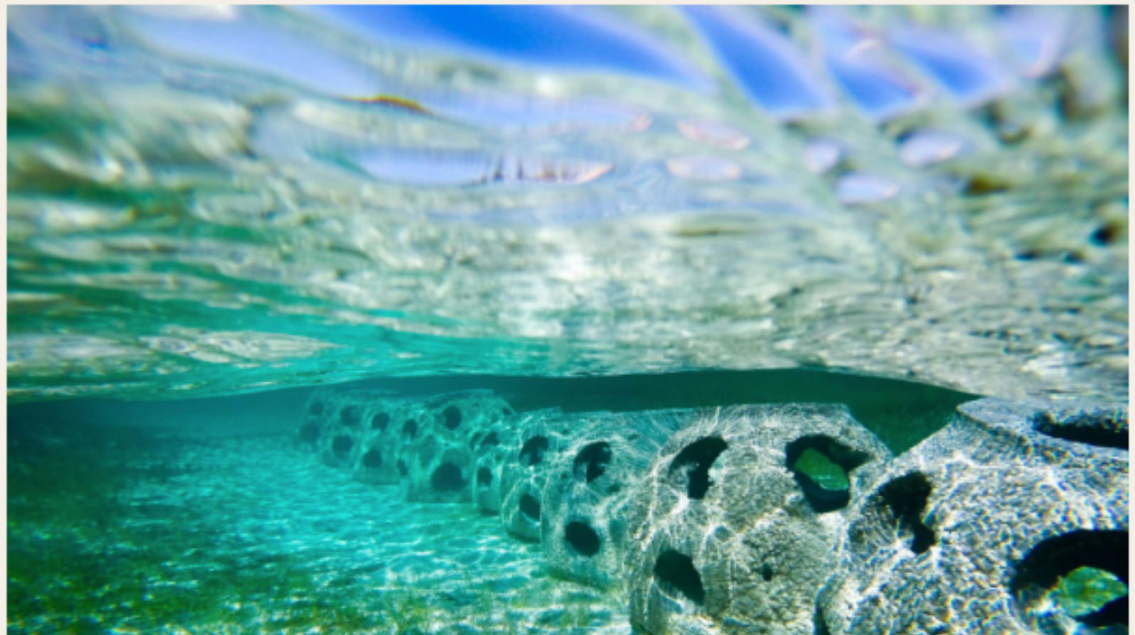
Reef Ball Foundation