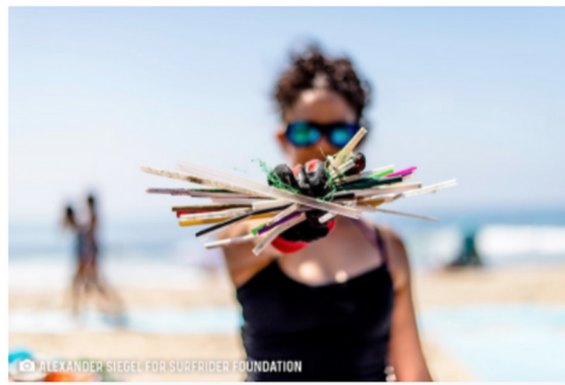
ALEXANDER SIEGEL FOR SURFRIDER FOUNDATION